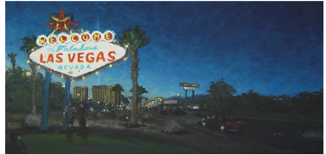
"Welcome to Fabulous Las Vegas Nevada"

(Charleston South Cackalacky) (14"x 18" - Oil on Canvas)