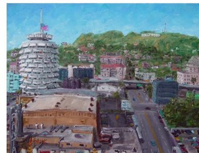
"Up Argyle from Hollywood"

(New Haven, CT) (14"x 18" - Oil on Board)