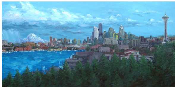
"A beautiful loss"

(Sin City, Nevada) (12"x 24" - Oil on Canvas)