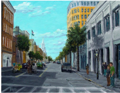
"Man vs. Horse"

(Firefighting in NYC) (16"x 20" - Oil on Canvas)