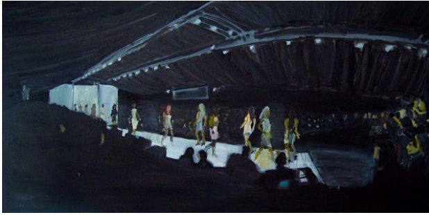
"Strut, Bounce, Strut"

(Fashion Show) (24"x 48" - Oil on Canvas)