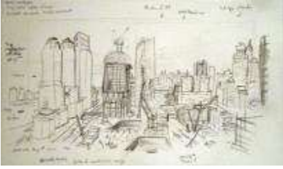
Sketch from Club Quarters, WTC