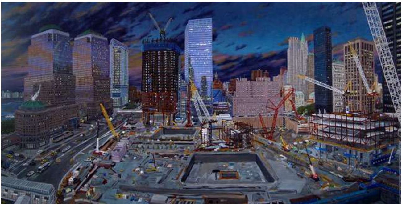
"Twenty-Seven Cranes" - Bringing the WTC back to Life"