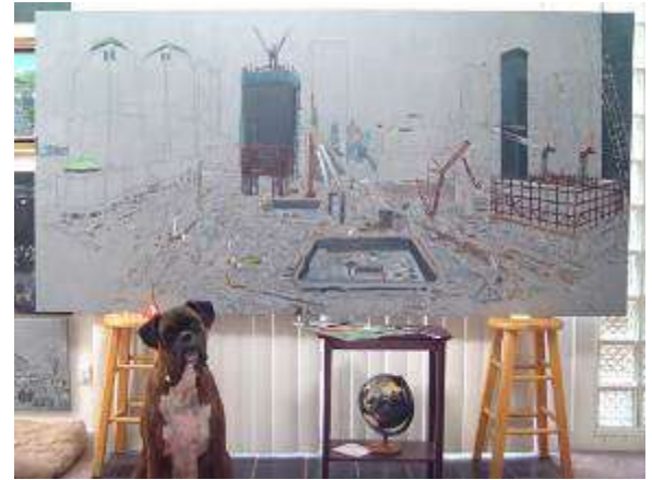
My boy Woody posing with the WTC painting in-work.

Artistically , it's been a unique year in the fact that I spent the great majority of time focusing on just one piece . Overall, I only added 3 more locales and I have now captured 28 unique cities in oil (all still personally visited) in order to focus on said special piece that I hope will garner attention from the art world. Following my trips to New York, Japan, Korea , I finished the en-plein air pieces I had started in Kyoto, Tokyo, and Soul. Afterwards I turned to creating a study , then started on the main 4 x 8 foot painting of the World Trade Center under construction titled "Twenty-Seven Cranes" - Bringing the WTC back to Life < (click on the link to watch a progression of work or check out this thread about it on a skyscraper forum ).