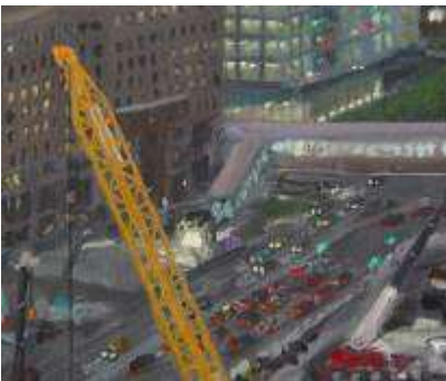
West St. Traffic