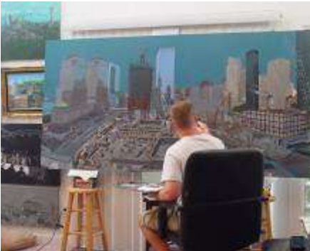
Working on the painting